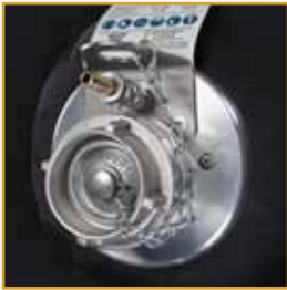
*OFT Pipe plug with bypass

All models suitable for testing according to NEN-EN 1610